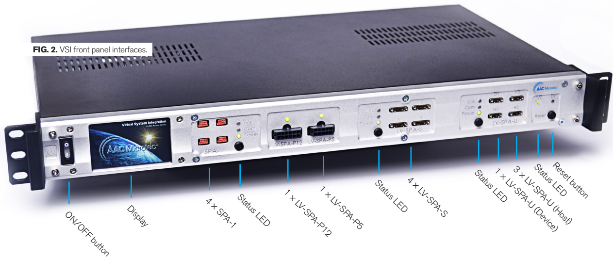
Figure 2 shows AAC Microtec VSI equipment and its front panel interfaces. The display allows certain critical functions to be run directly from the unit. Users simply type in the IP addresses of remote devices to which they want to connect. One example of such a key function is the reporting of voltages and currents drawn on connected devices to other locations.